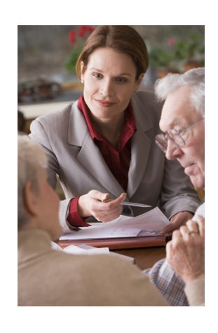
The key is to pick the best plan for your circumstances and objectives, and to seek help from financial and legal advisors to carry out this plan.

When developing a succession plan for your business, you must make many decisions. Should you sell your business or give it away? Should you structure your plan to go into effect during your lifetime or at your death? Should you transfer your ownership interest to family members, co-owners, employees, or an outside party? The key is to pick the best plan for your circumstances and objectives, and to seek help from financial and legal advisors to carry out this plan.